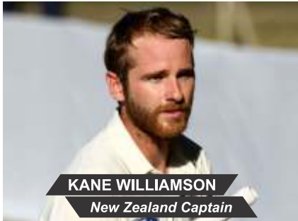
KANE WILLIAMSON New Zealand Captain