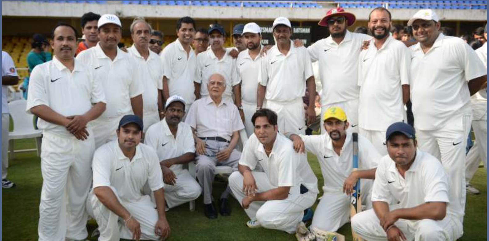
West Zone Team, winner of J.K. Bose T20 In Ahmedabad 2015.