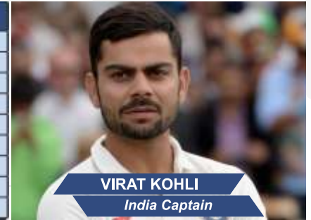
VIRAT KOHLI India Captain